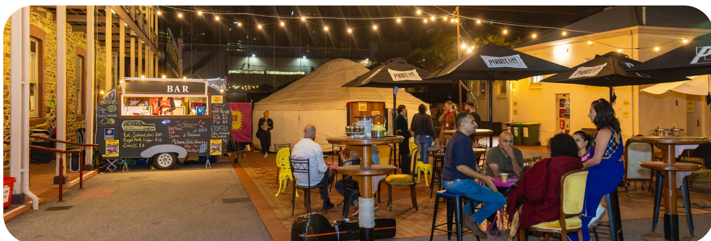
The Courtyard of Curiosities at the Migration Museum, Adelaide Fringe Photo: Razan Fakhouri, 2024.