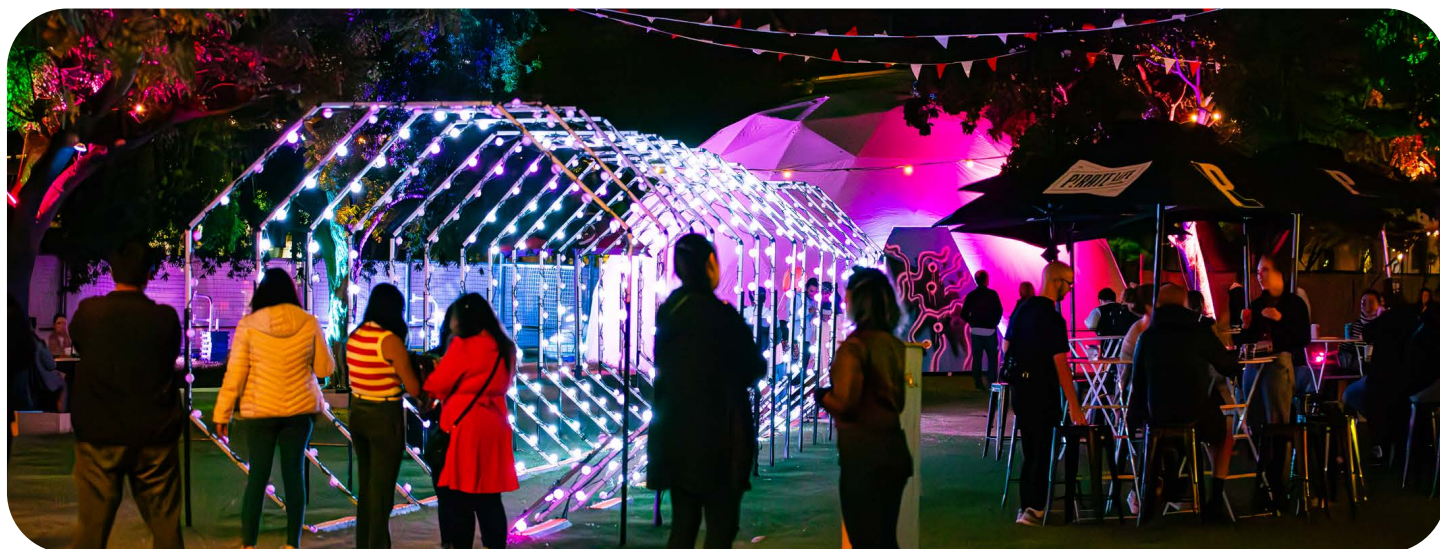
Fool's Paradise, Adelaide Fringe