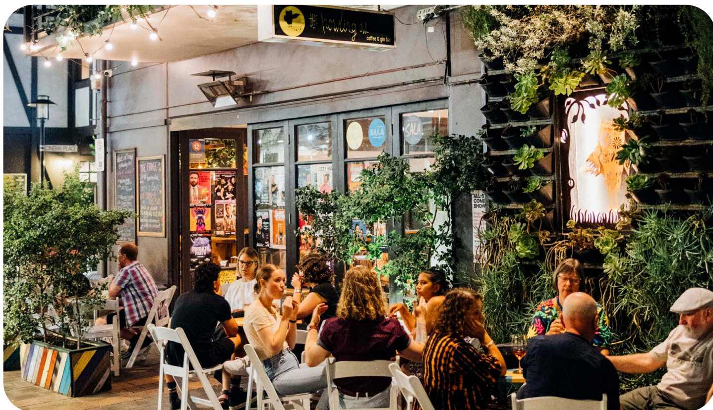
The Howling Owl, Adelaide Fringe Photo: Samuel Graves, 2024.

Ticketing support and resources, plus assistance with reporting and data collection.