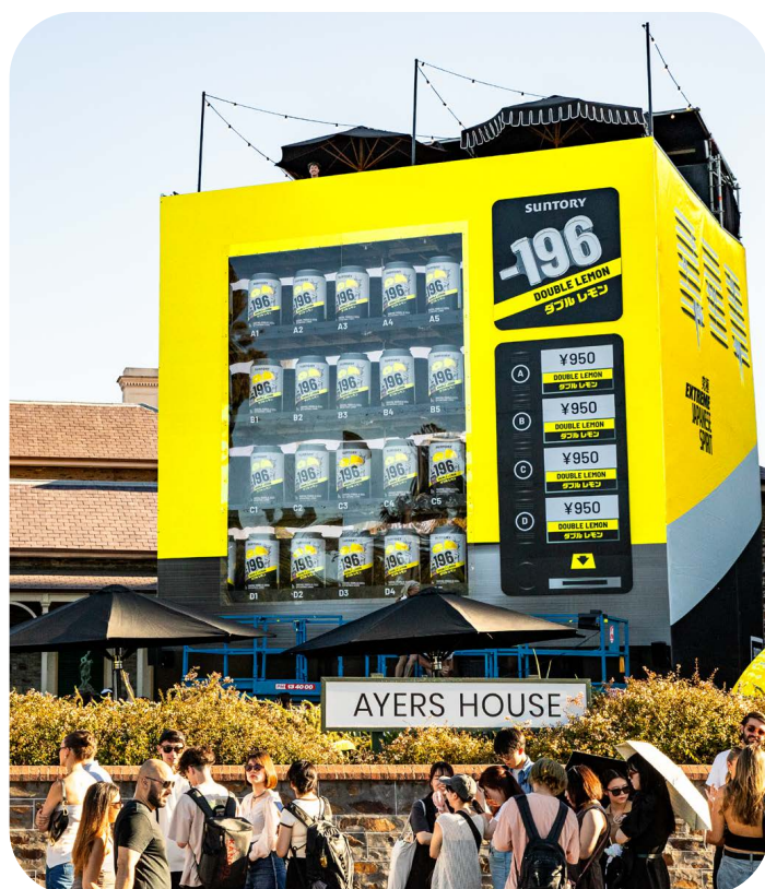
Ayers House, Adelaide Fringe