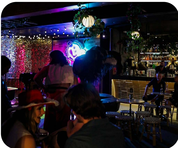
Nineteen Ten, Adelaide Fringe