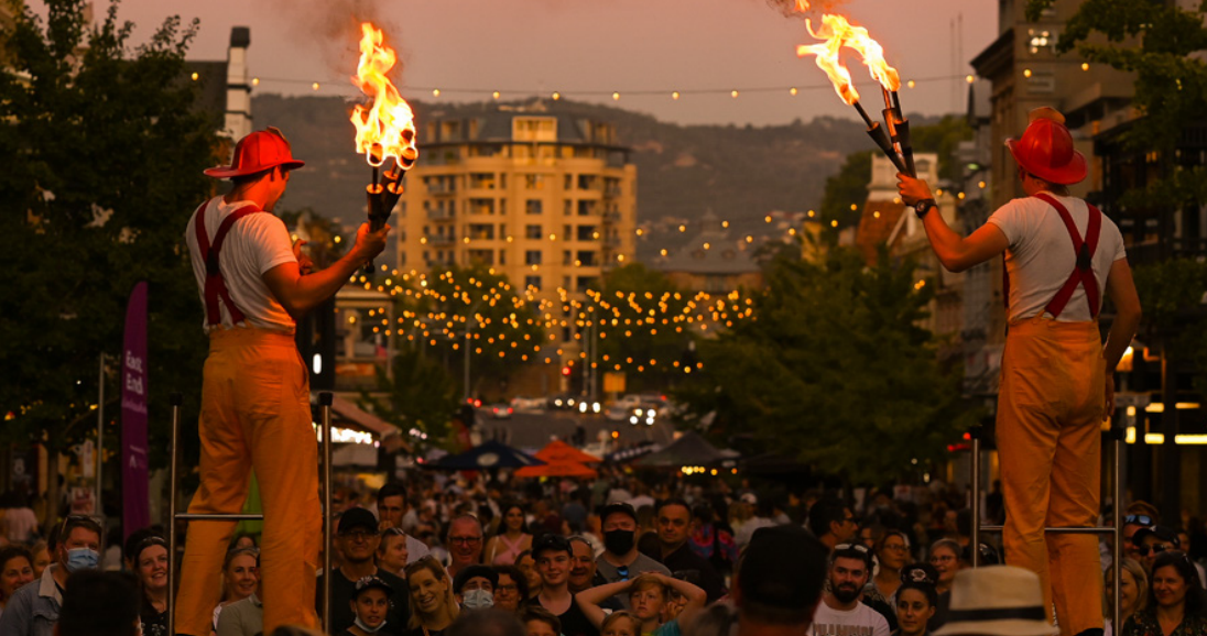
East End.