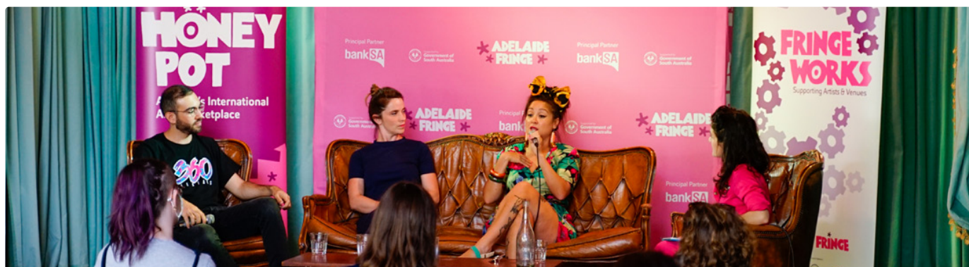
Honey Pot: In Conversation.

In order to keep industry and artists connected post-Fringe, these two important applications will be kept open and available to all registered Honey Pot artists and delegates. We recognise that outcomes can take months to come to fruition so we wanted to keep the connections, conversations and follow ups going all year!