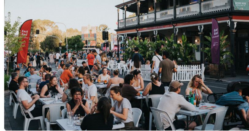
East End Closing Night.

Activities around the city - click for more info