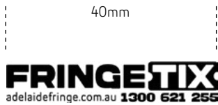
Inline - Print